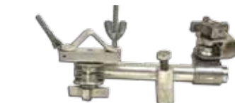
KBUG-1054 Cable Anchor